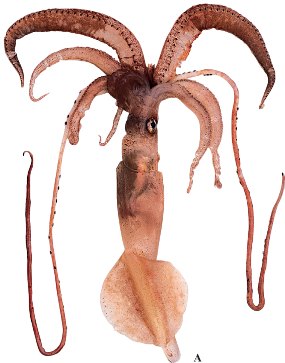
A : 井田 斉 (館山湾)

ML 25 cm (尾部を含む). 全身寒天状で柔らかい. 外套膜は細長い円錐形で, 鰭は円形, 後方の長い尾部の両側もやや翼状に広がる. 頸は長く円筒形. 眼の周縁に 3 列に並ぶ発光器がある. 腕も寒天質であるが IV 腕は特に膨大するのみならず組織に埋った 55 個の発光器がある. 触腕柄部は長く, この上に 40 個の発光器がある. 触腕吸盤は長い柄をもち翼状の保護膜があり, 4 横列が凡そ 90 列あり, 掌部先端に発光器がある. 墨汁囊上の 1 対の水滴型の発光器がある. 日本近海, インドネシア, インド洋西部. C. imperator Chun, 1910 は異名.