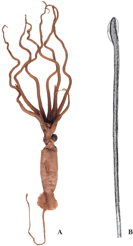
A : 久保田正 (駿河湾), B : Young & Roper (1969)