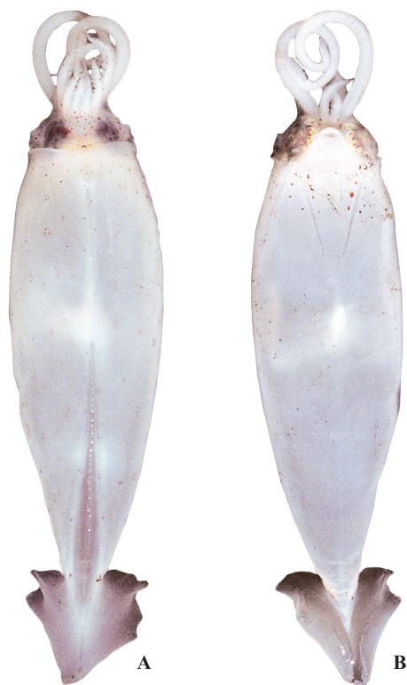
A, B : 久保田正 (駿河湾)